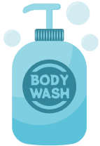
Body Wash OR Bar of Soap